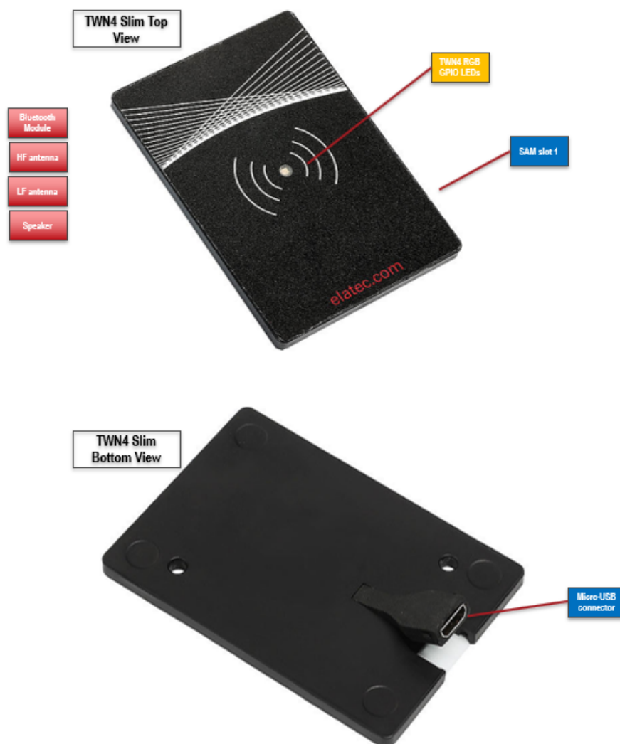
Figure 2.1: TWN4 Slim View Functional

The TWN4 Slim can also interact with the User via Bluetooth Low-Energy interface. This development pack contains documentation on BLE protocol and API implemented on the module.